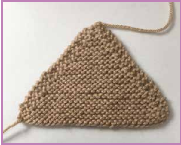
1 Lay the head triangle on a flat surface, as shown.

After countless requests on how to make the basic bear's head, here are some step-by-step instructions, with photos, to help you. Try not to over stuff the body of the bear and keep it in proportion to the head to achieve a uniform effect. Stuff the top of the arms very lightly, so that they will sit nicely when they are attached to the body.