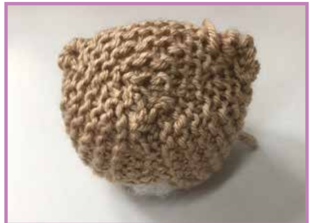
6 Stuff the head and shape it as you do. It needs to be quite firm, but not overstuffed.