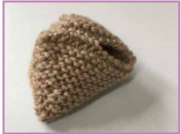
4 Turn the head over and sew a small way down from the nose towards the neck. Leave a small opening to enable you to stuff the head.