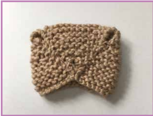
3 Bring the points on each side to the centre point, and sew each side seam of the head using a flat seam, and leaving a tiny section unsewn at the top on either side of the head to form the ears.