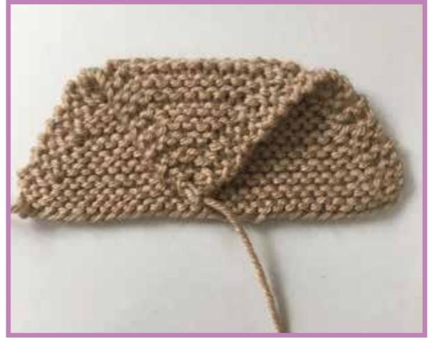
2 Bring the top point to the centre of the base.