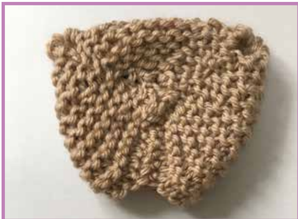
5 This is how your head should look before you begin to add the stuffing.