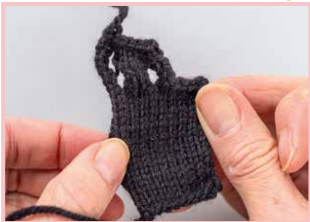
This is how the hand piece will look when knitted.