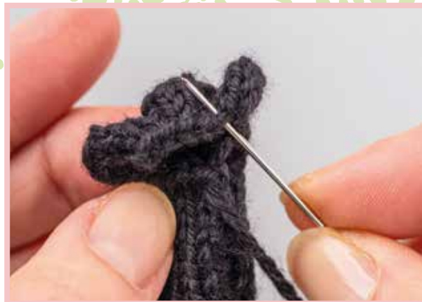
Fold the hand in half horizontally and sew the first and second cast-off edges together.