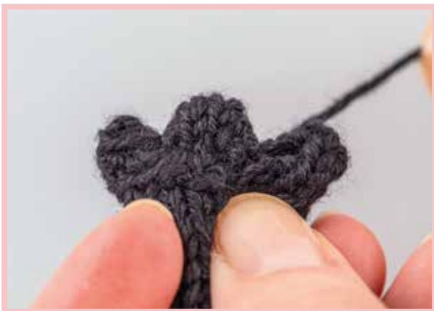
Sew the edges together.