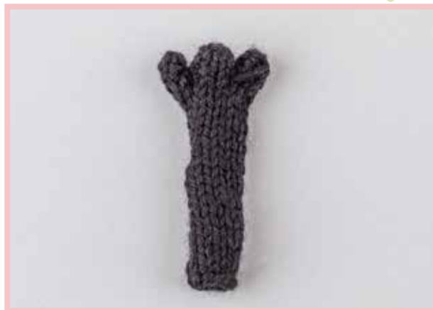
The finished hand.