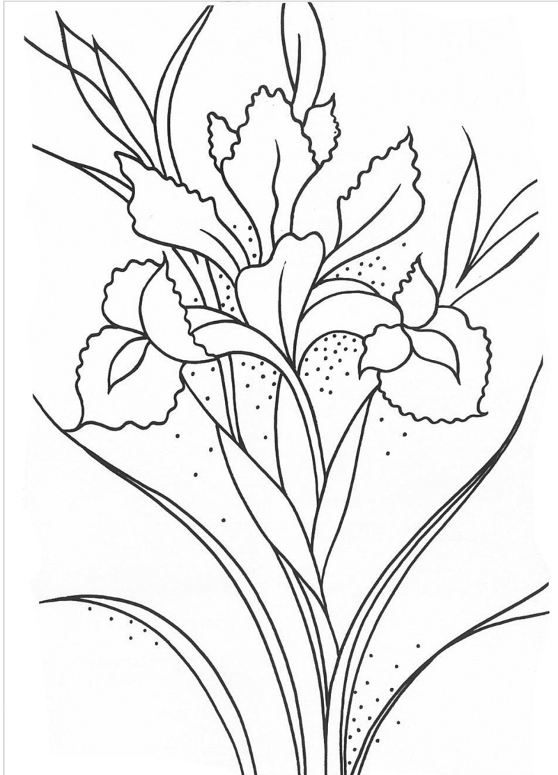
The Iris design from page 30

Enlarge by 250% for a full-size pattern.